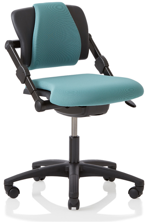
Design: Søren Yran Patent- and design protected